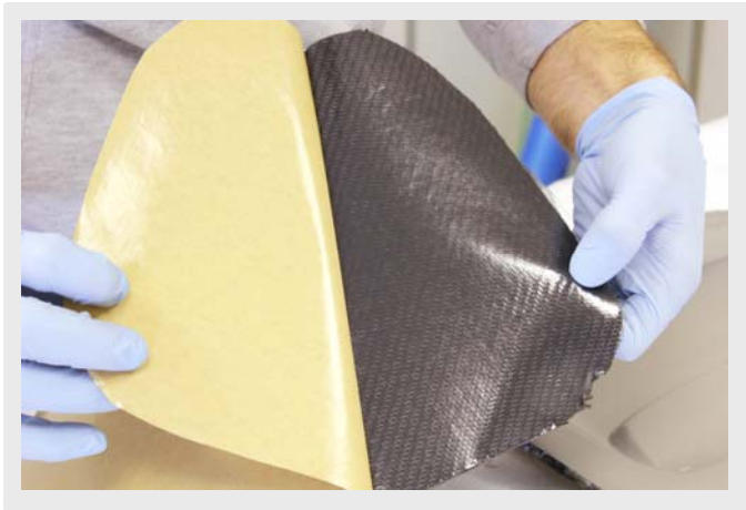
Carefully peel the backing paper away from the Easy-Preg surfacing ply. Only one side has a resin film.