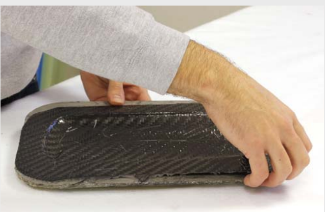
Releasing parts is simply a matter of sliding a fingernail or plastic card under an edge of the cured laminate.