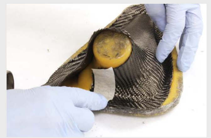
To create a perfectly straight seam at the back of the duct where the material meets, masking tape is used to mark a vertical line.