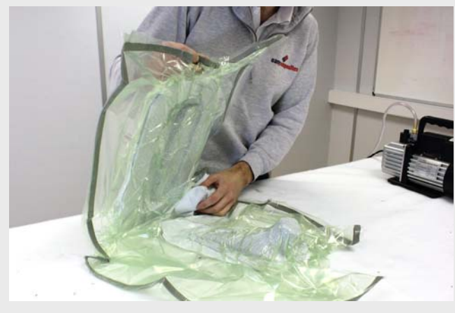
When bagging multiple parts at the same time it is possible to fold the bag over on itself...

Pre-heat your oven to 100°C and ensure your vacuum bag is at full vacuum pressure before closing the vacuum valve on the pump and disconnecting the vacuum hose.