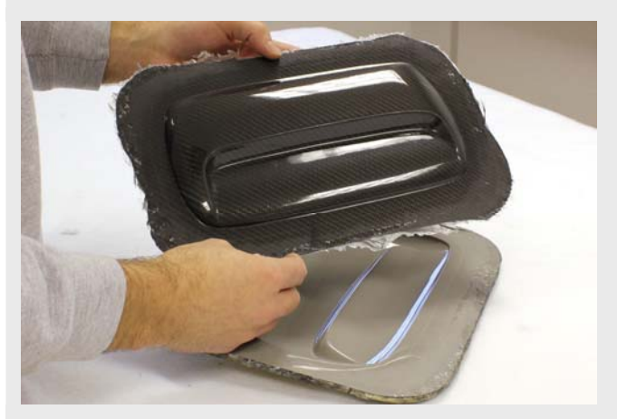
This bonnet scoop has a high gloss finish straight out of the mould.