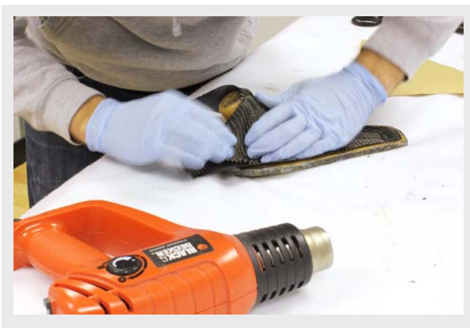
A very contoured shape like this NACA duct requires gentle application of heat to make the prepreg more pliable.

You may find a range of different shaped blunt tools useful to help you press the prepreg firmly into tight corners on your mould. Objects such as credit cards, ice scrapers, and even grouting tools are often used.