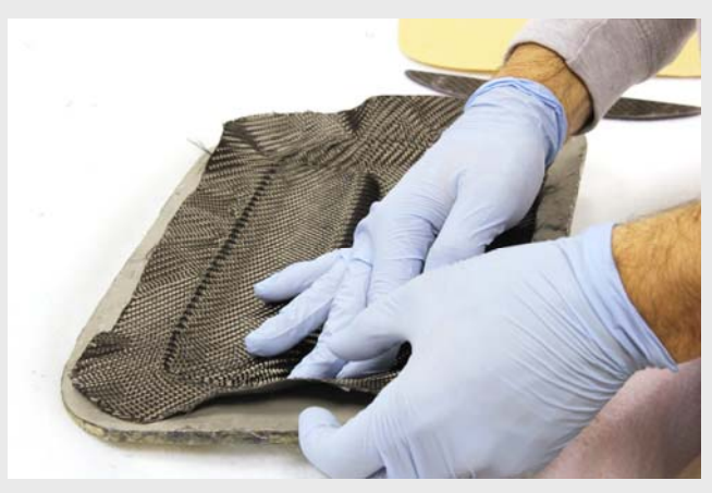
Continue to work the prepreg, gently smoothing and shaping it into the contours of the mould.

To begin, peel the backing away from the prepreg carefully and then gently drape the material, film-side down, into the mould. Start by smoothing the prepreg gently onto a larger, flatter area of the mould and then gently pull and smooth the material over the more complicated areas of the mould. You may find it helpful to use a heat-gun or hair drying to soften the prepreg slightly so that it can be distorted and formed more easily. You may actually be surprised how malleable and resilient prepregs are in this respect, compared to dry fabrics, and with a little patience you should be able to put the Easy-Preg down over the whole surface of the mould.