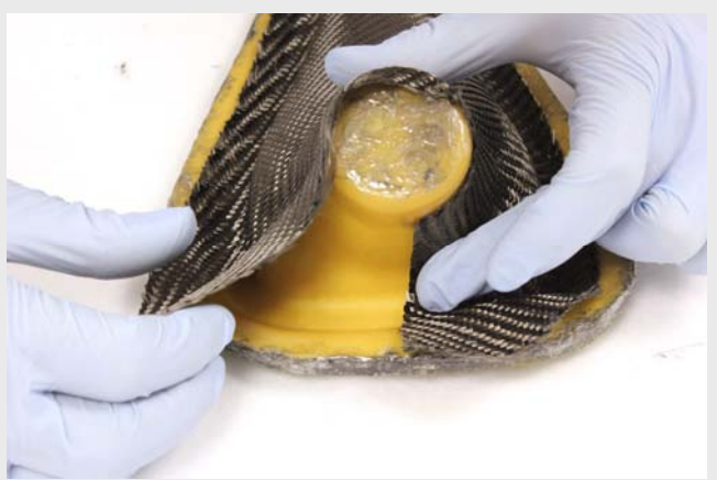
The other side then overlaps the cut edge, resulting in a perfect seam.