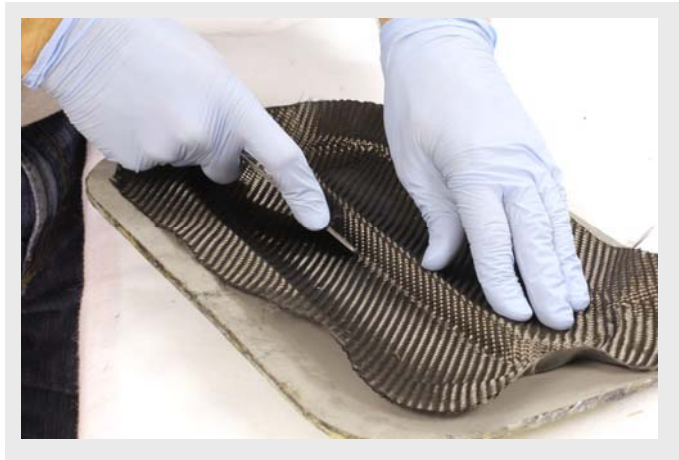
Use blunt tools (often home-made) to press the prepreg firmly into any tight corners or angles of the mould.

To begin, peel the backing away from the prepreg carefully and then gently drape the material, film-side down, into the mould. Start by smoothing the prepreg gently onto a larger, flatter area of the mould and then gently pull and smooth the material over the more complicated areas of the mould. You may find it helpful to use a heat-gun or hair drying to soften the prepreg slightly so that it can be distorted and formed more easily. You may actually be surprised how malleable and resilient prepregs are in this respect, compared to dry fabrics, and with a little patience you should be able to put the Easy-Preg down over the whole surface of the mould.