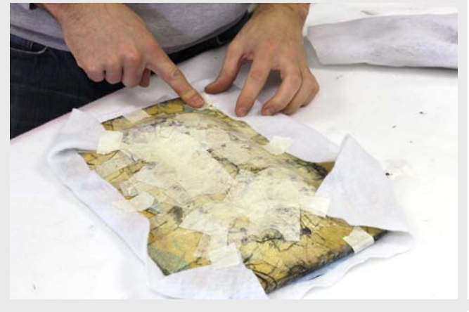
Roughly cut pieces of breather to cover your part(s). The breather cloth should be cut at least 60mm oversized so that it can loosely wrap the part.