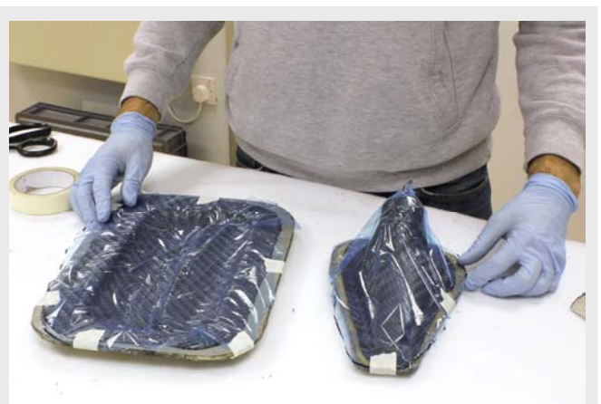
Tape the edges of the release film onto the back of the mould with some masking tape to hold it in place.

Because you cut the release film some 25-50mm larger than the reinforcement, you should find that it overhangs past the edges of the laminate. Use this overhanging release film to wrap round onto the reverse of the mould and hold the film very loosely in place using masking tape. It is certainly not the right technique to pull the release film tight during the process of taping it in place as this would be likely to use up the excess of film that is preventing the film from bridging.