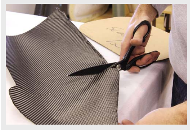
The Easy-Preg surfacing ply is easily cut with a pair of composites shears or normal scissors.

The Vari-Preg bagging ply has a removable film on both sides and so can easily be marked out using a marker pen directly onto the backing film. Unlike the surfacing ply, the backing ply is not 'sided' and so either side can be marked.