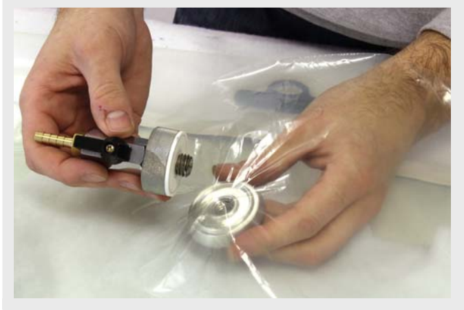
Pass the threaded part of the connector through the hole in the film and place the other half inside the bag.