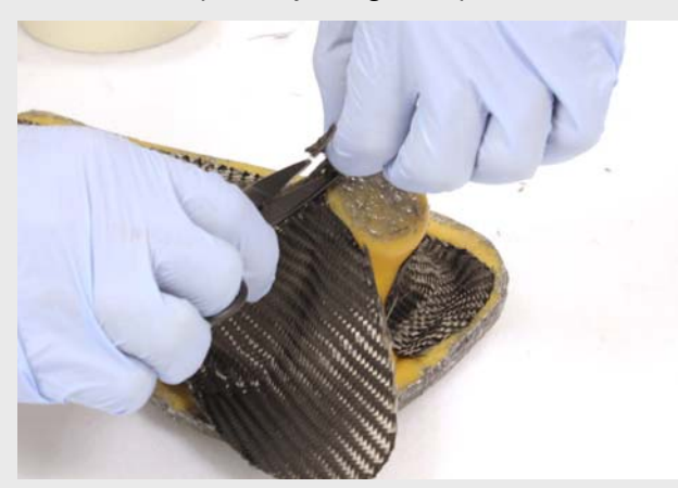
Composites Snips are useful for snipping off small excesses of material