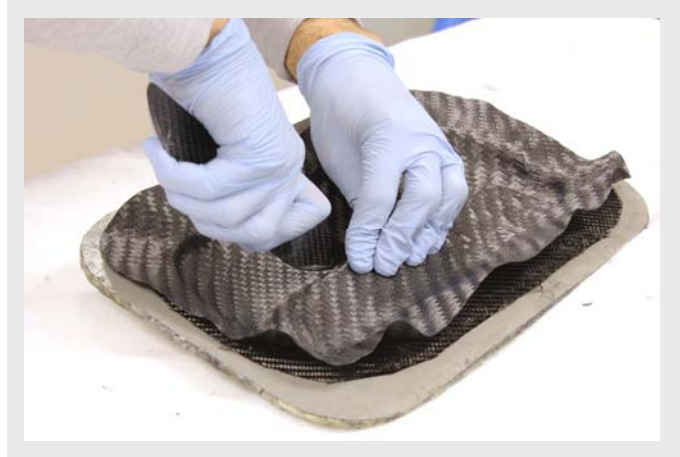
Just like with the surface ply, blunt tools are recommended to press the prepreg firmly into any tight corners of the mould.