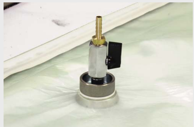
Screw the two halves together tightly to complete the through-bag connector fitment.

Use your fingers to make a small peak in the vacuum bag directly above where the Through-Bag Connector will be positioned. Use scissors to snip about 5mm off the top of the peak to make a small round hole in the vacuum bag.