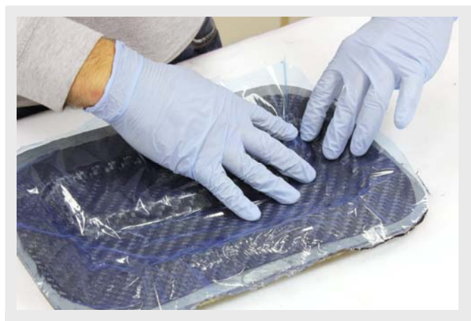
The film should comfortably cover the whole part. Don't worry if it's oversized or wrinkled but ensure the film is not 'tight' and does not 'bridge' anywhere on the part.