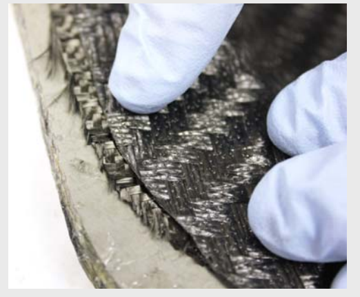
This close-up shows how later in the guide we will ensure that the backing ply/plies are slightly smaller than the surfacing ply, ensuring air paths to the surface are maintained.

In most cases, when laminating a part the surface ply should be made a few millimetres larger than the backing ply/plies. This is done to ensure that the air path that is created by the special dry side of the Easy-Preg Surfacing Prepreg is not maintained all the way out of the laminate ensuring that any air trapped in the reinforcement can be removed when the part is vacuum bagged. In practice, it is not necessary for the surfacing ply to extend beyond the backing ply all the way around the part but it should be aimed for as a matter of good practice. Although you could make templates, one for the surface layer and one for the backing layer, it is usually sufficient to simply mark out the surface layer by drawing slightly wider than the template when you transfer the template to the prepreg material, making a separate template for the surface layer unnecessary.