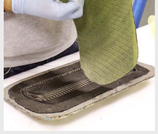
Backing film is removed from prepreg carbon fibre before laminating.

Only at elevated temperatures, known as the cure temperature, does the resin really start to react and cure properly which is why prepregs must always be cured in an oven of some description. Typical cure temperatures for prepregs range from 60°C up to around 180°C with the most common cure temperature for out-of-autoclave pre-pregs being around 100°C. Temperatures such as these can easily be reached by domestic and commercial cooking ovens as well as other types of oven including paint drying and powdercoating ovens. Although it is possible to successfully cure a prepreg part without having an active vacuum line inside the oven, it is certainly preferable.