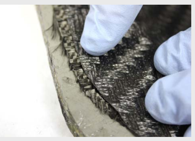
Having cut the backing ply smaller than the surface ply, a small amount of surface layer should extend past the backing layer all the way around the mould.

A heat gun is certainly recommended when putting down the backing ply or plies where you will find that lightly warming the prepreg before or whilst it is put down will soften the resin and allow the material to drape more easily.