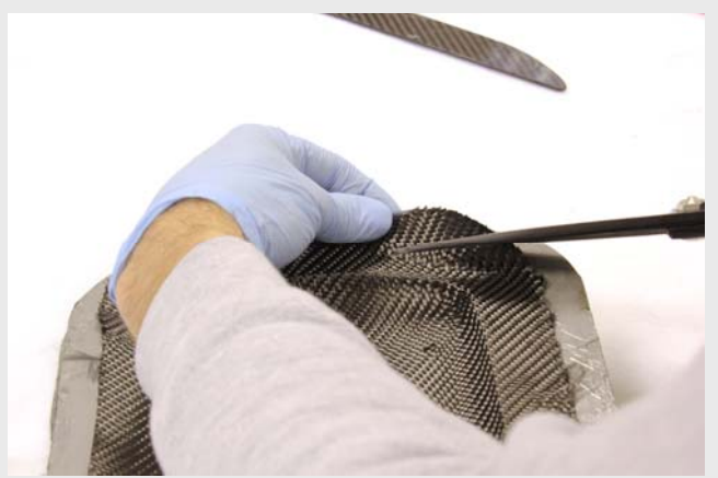
Once down, trim off any excess material so that the prepreg does not reach the edge of the mould's flange.