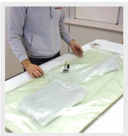
Position the connector in a gap in the bag, on some breather connected to the part(s).

Do NOT position the Through-Bag Connector directly on top of a part, instead sit it on a piece of breather in a gap in the vacuum bag.