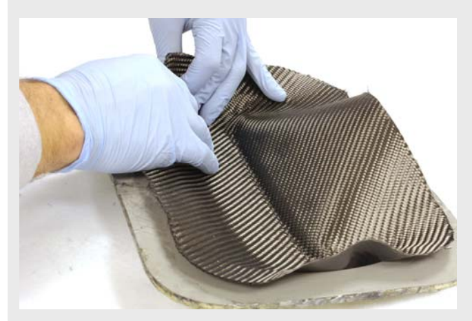
Start conforming the prepreg to the mould by pressing and smoothing it down on the flatter areas of the mould.