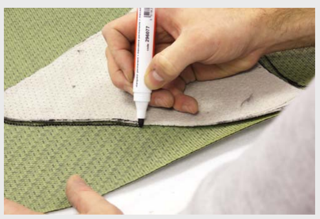
The backing ply can easily be marked using a permanent marker pen on the removable film.

Transfer the outline of the cutting template(s) first to the surfacing prepreg and then to the backing ply. The Easy-Preg surfacing prepreg only has a removable film on one side and the film itself is waxy and difficult to mark by pen so the recommended means of transferring the template to the surface ply is by scoring the dry side of the fabric with a blade or some other sharp object. Remember that the surface layer should be larger than the backing layer by a few millimetres all the way around to ensure that air can be fully evacuated from the laminate. To do this, simply mark slightly wider than the cutting template when marking the surfacing ply.