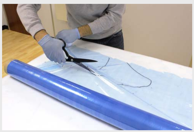
Cut the film with shears or a craft knife.

Cut off an adequately sized piece of unperforated release film to cover the surface of your mould in one piece. If you like, use the cutting template created for the reinforcement as a guide but cut round the template making it 25-50mm larger than you cut the reinforcement.