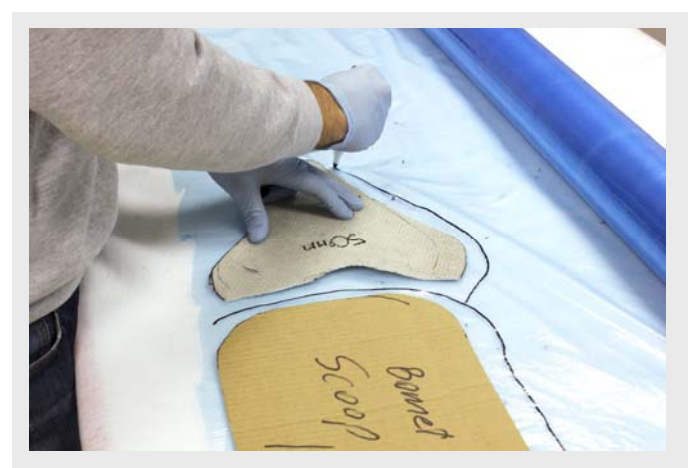
Use your prepreg templates as a rough guide but ensure you cut the release film at least 25-50mm oversize.

Once you have laminated all the plies of prepreg into the mould and you are confident that all the material is in intimate contact with the mould surface (particularly any tight corners) you are now ready to start the vacuum bagging process. The first layer of which is an unperforated release film.