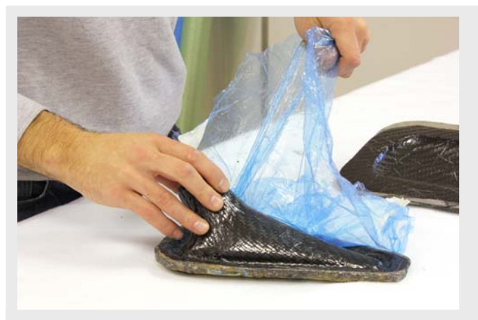
Release film virtually falls off the parts in seconds.