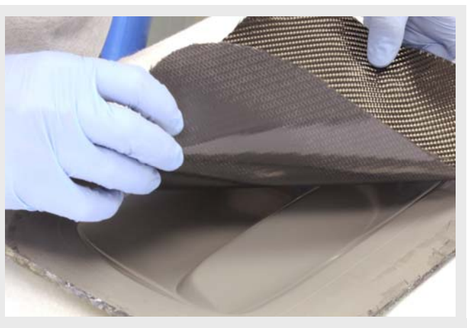
Gently lay the Easy-Preg down onto the mould, film side down .