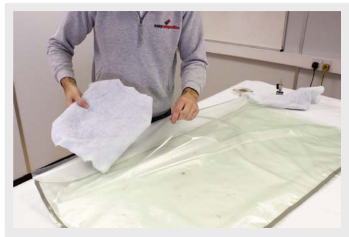
Load the part(s) into the envelope bag, facing upwards.