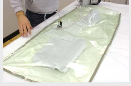
An 'envelope bag' completely encloses the part(s) instead of bagging film being pleated and taped to the mould's flange.

Some disadvantages of this method are that you will use more bagging film, you need to be more careful when handling the bagged parts and very large parts are not practical to bag in this way because they need to be lifted and loaded inside the bag. On balance, it is almost always right to envelope bag your prepreg parts, but be aware of these considerations.