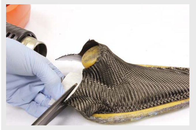
The surface ply can then be gently peeled away from the mould and cut perfectly along the tape line.