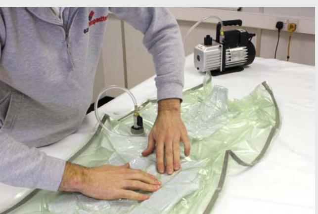
Push and pull the bag from side to side to free up more 'slack'. The whole surface should have an excess of bag.

Open the valve again to draw some more air out and repeat the process all over again. Keep doing this until you reach full vacuum in the bag. We would usually take about 4-5 steps of opening and closing the vacuum and positioning and pushing the bag before we reach full vacuum.