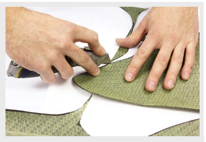
The backing ply is best cut using a Stanley knife on a cutting mat to avoid clogging shears.

Once you've marked out the two pieces of material, cut them using a Stanley knife or pair of shears.