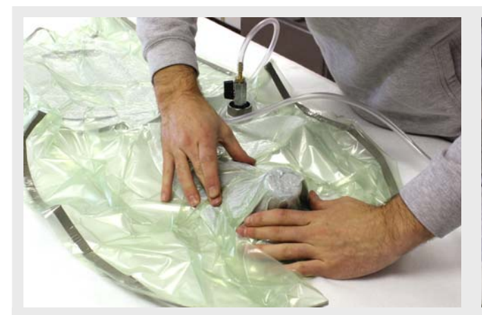
Push plenty of 'wrinkles' of bag into difficult shapes like the underside of this duct. The more wrinkles the better!

surface. Pay particular attention to awkward corners where you will want to 'collect' extra bag so ensure it's not possible for the bag to bridge.