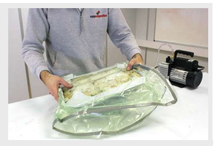
...making it possible to cure multiple parts at the same time in a small oven.