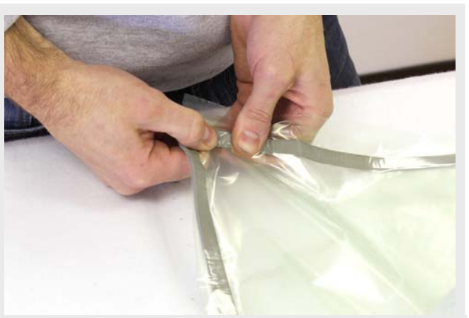
Always ensure you make the bag much larger than the parts. When using lay flat tube (LFT) bagging film, use the ready-made edges of the film where possible.