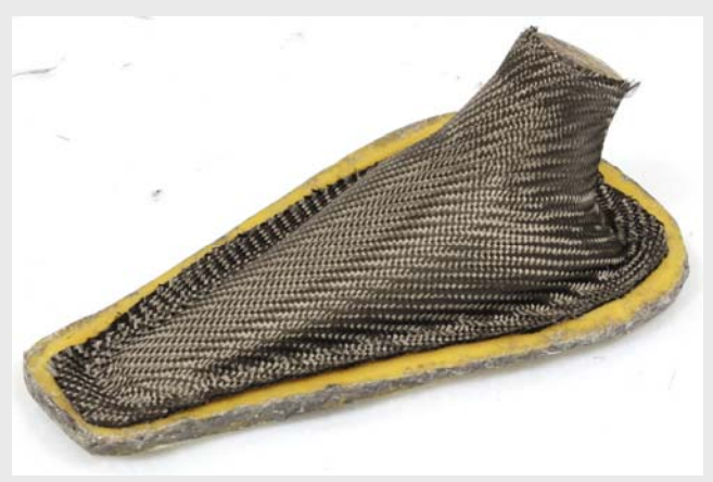
The natural tack of the Easy-Preg makes even a difficult shape like this NACA duct quite straightforward.